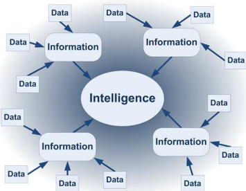
Data to Intelligence